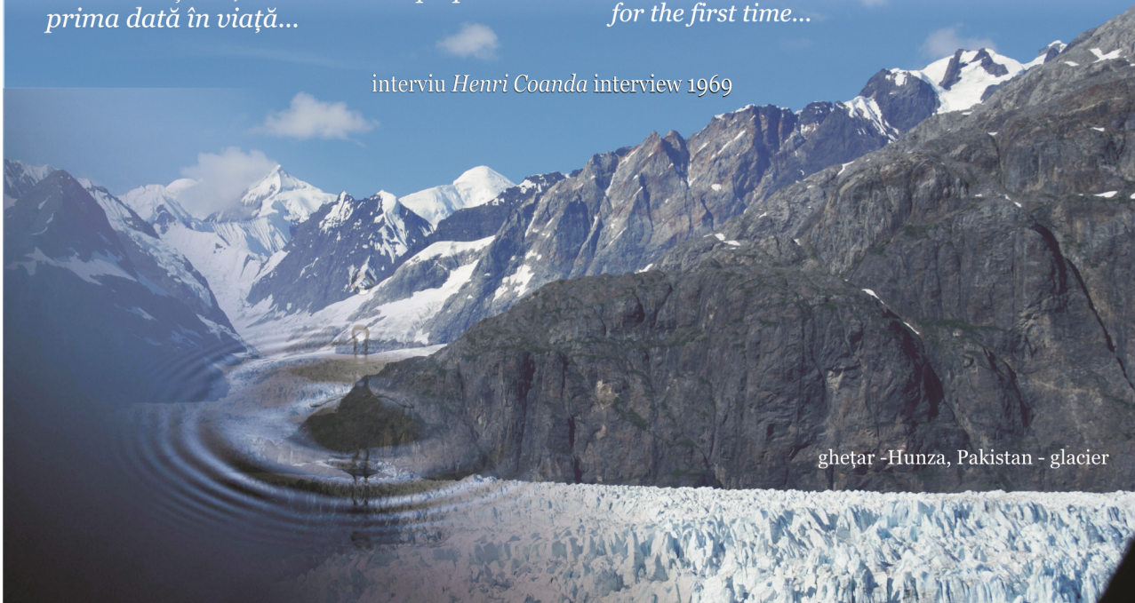
ghețar -Hunza, Pakistan - glacier